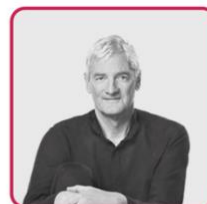
James Dyson is dyslexic?