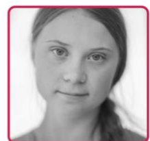
Greta Thunberg is autistic?