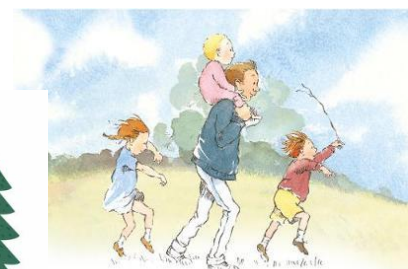
We're Going on a Bear Hunt