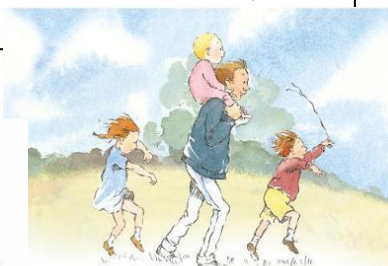
We're Going on a Bear Hunt Michael Rosen • Helen Oxenbury